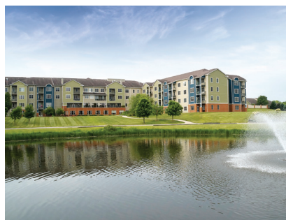
Deerfield 13731 Hickman Road Urbandale, IA 50323