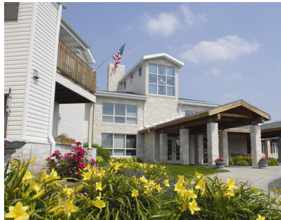
Trinity Village 522 West Lincoln Street Papillion, NE 68046