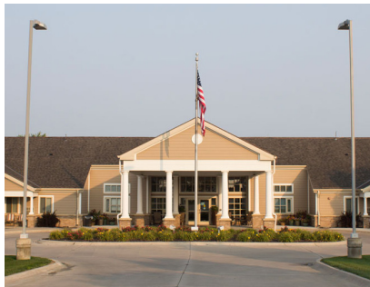
Yankee Hill Village 8401 S. 33rd Street Lincoln, NE 68516