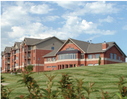
Pacific Springs 805 S. 173rd Court Omaha, NE 68118