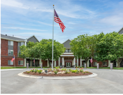
Arboretum Village 8141 Farnam Drive Omaha, NE 68114