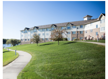
Copper Shores Village 1500 Edgewater Drive Pleasant Hill, IA 50327