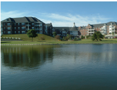
The Landing 3500 Faulkner Drive Lincoln, NE 68516