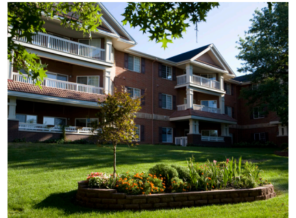
Grand Lodge 4400 S. 80th Street Lincoln, NE 68516