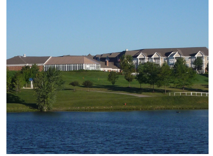
Lakeside 17475 Frances Street Omaha, NE 68130