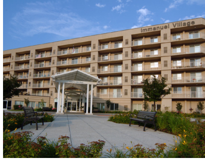
Immanuel Village 6803 N. 68th Plaza Omaha, NE 68152